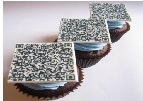
Fig. 1. QR code

A quick response (QR) code is a type of barcode that can be read easily by a digital device and which stores information as a series of pixels in a square-shaped grid. QR codes are frequently used to track information about products in a supply chain and often used in marketing and advertising campaigns. QR codes are considered an advancement from older, uni-dimensional barcodes, and were approved as an international standard in 2000 by the International Organization for Standardization (ISO). QR codes were designed by DENSO WAVE in Japan and first came into use in 1994. Although the term "QR code" is a registered trademark, the technology itself has not been patented and is therefore available for anyone to use.