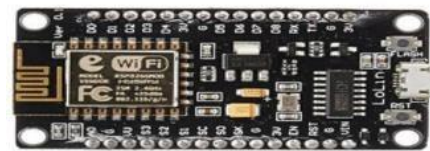
Fig. 1. NodeMCU

English-language documentation on the chip and the commands it accepted.