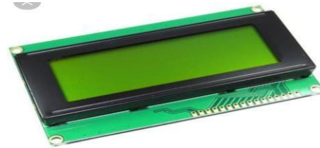
Fig. 2. LCD

A liquid crystal display (LCD) is a thin, flat display device made up of any number of color or monochrome pixels arrayed in front of a light source or reflector. Each pixel consists of a column of liquid crystal molecules suspended between two transparent electrodes, and two polarizing filters, the axes of polarity of which are perpendicular to each other. Without the liquid crystals between them, light passing through one would be blocked by the other. The liquid crystal twists the polarization of light entering one filter to allow it to pass through the other.