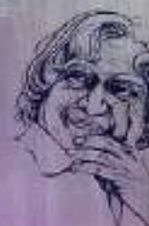
A. P. J. Abdul Ka