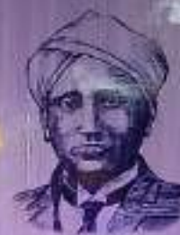
Sir C. V. Raman