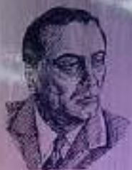
Homi J. Bhabha