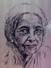
E.K. Janaki Ammal