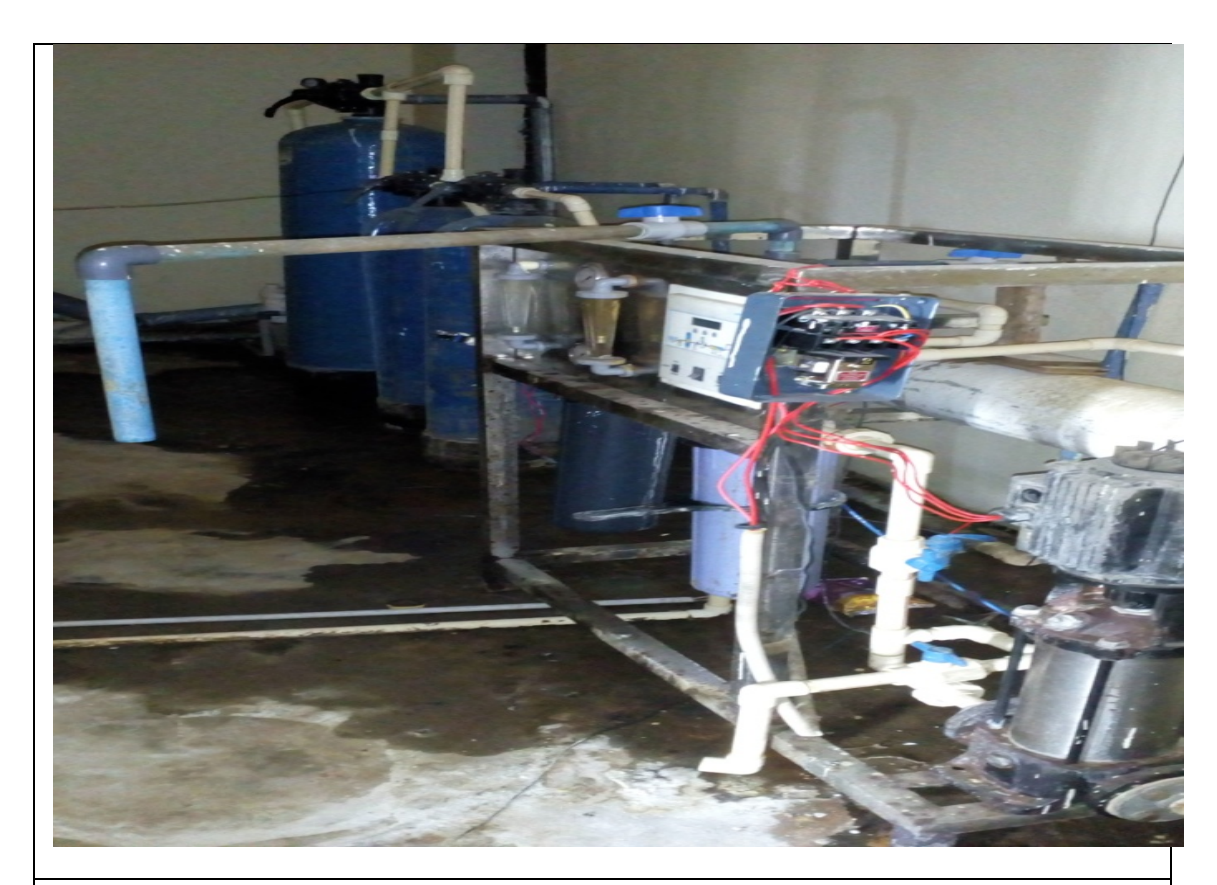
RO Mineral Water plant