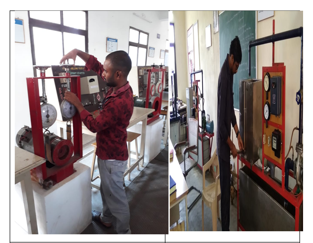
Maintenance at electrical machines lab