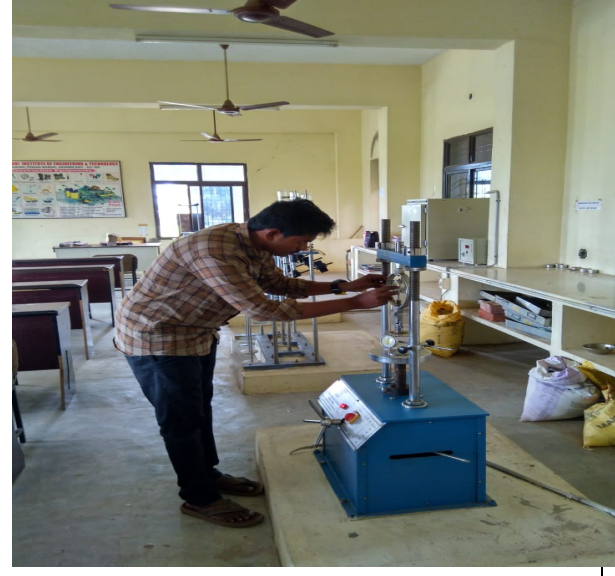
Maintenance at FMHM lab