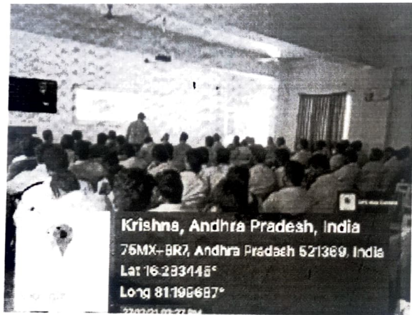
student participating in the webinar